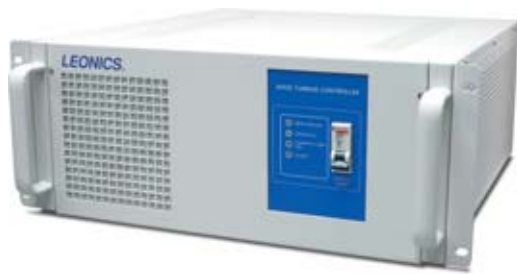
Rack mount case