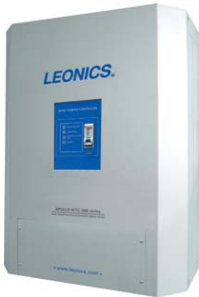
Wall mount case