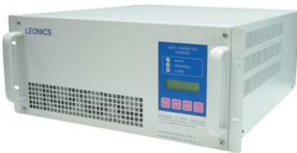
Rack mount case