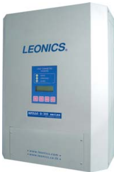
Wall mount case